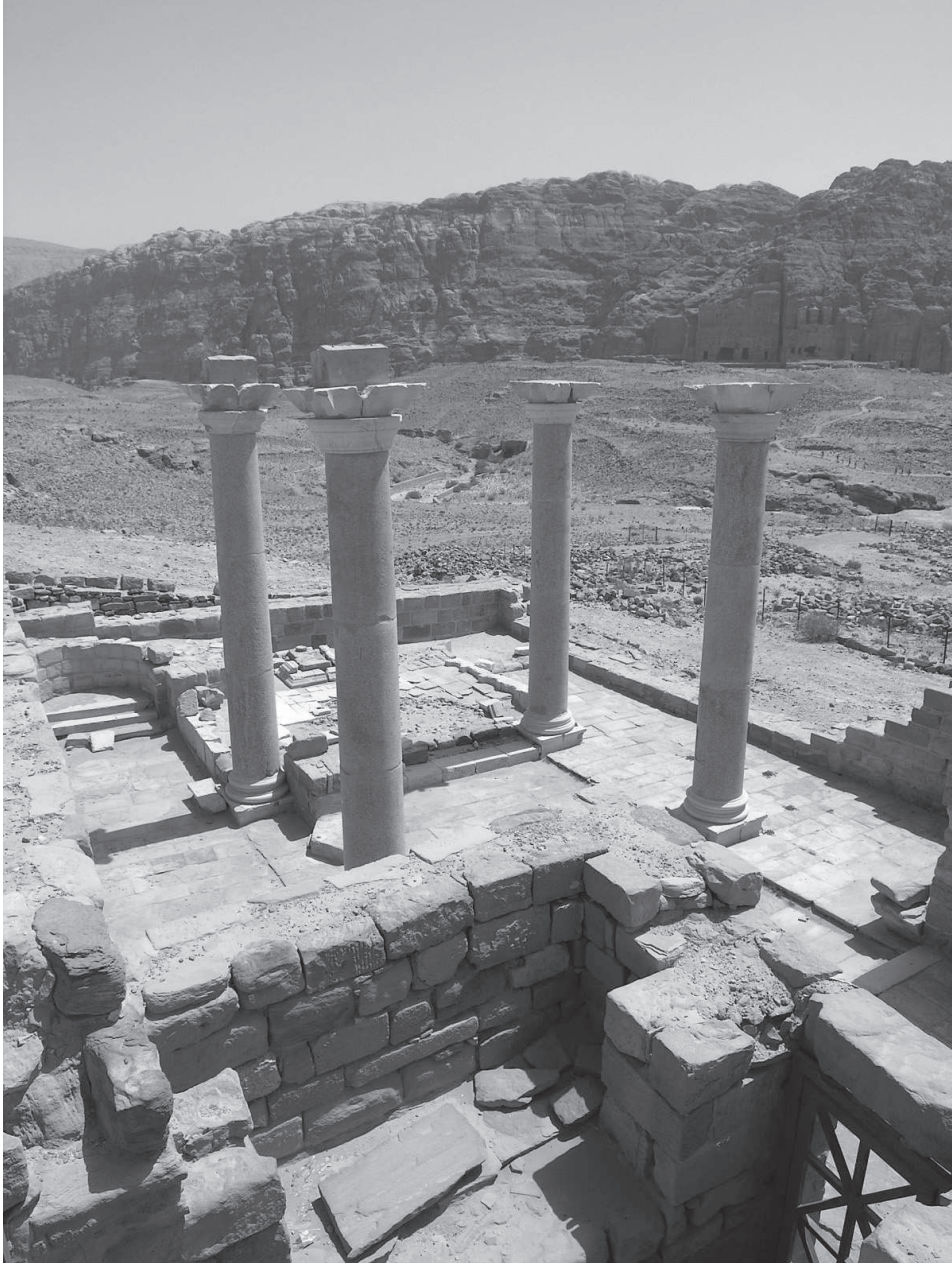
FIG. 5. The Blue Chapel featuring granite columns. The NEPP site is located in the background, in the straight line from the two right-hand columns.