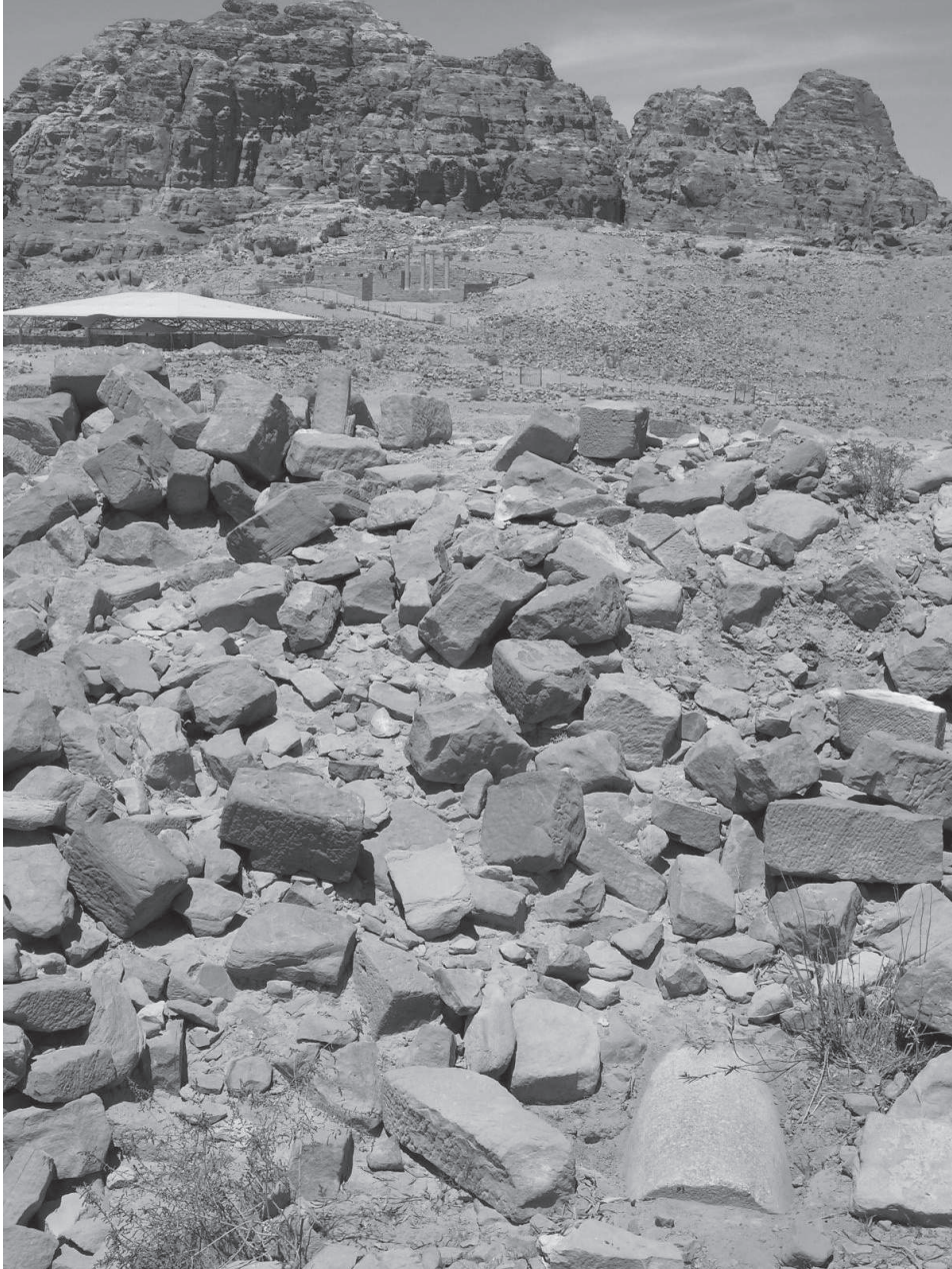
FIG. 6. Structure 1. The interior featuring a collapsed granite column. In the background: the Petra Church (left) and the Blue Chapel (centre).