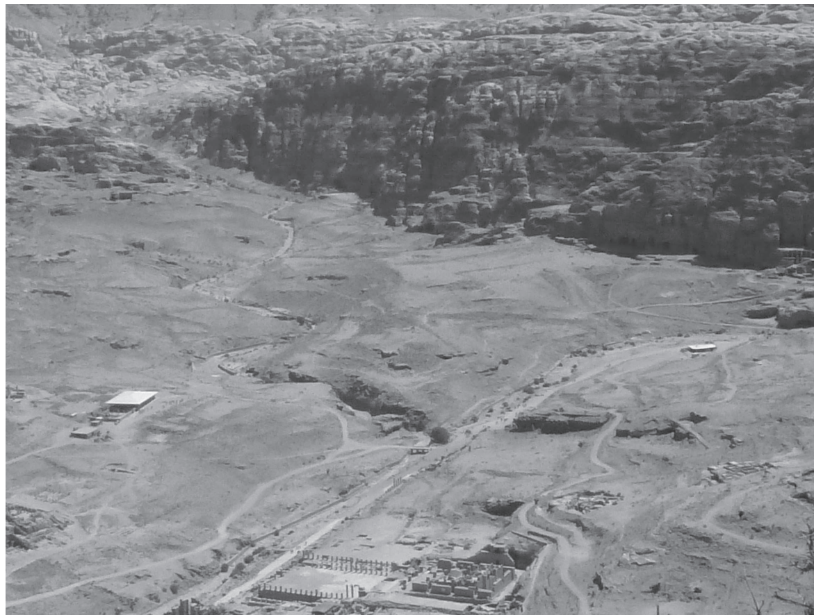
FIG 2. The NEPP area located between the Wadi Matahah (left), the Wadi Musa (right) and the face of the al-Khubthah massif. View from the West.