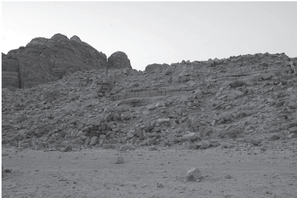
FIG. 4. The façade of Structure 2. View from the North.

blocks were either reused or the door was blocked. Also, considering the size of some elements inside or directly outside the building, it seems uncertain how these could have been accommodated in the structure in its extant appearance. Probably, Structure 1 features at least two major occupational phases and the earlier one could have been ended by a significant disaster. In Phase 1, it was probably a rectangular building consisting of one large hall (currently, the two major rooms). One entrance was presumably in the eastern wall, flanked by two smaller, tower-like rooms. The external corners were decorated with quarter columns and shallow pilasters. Another door might have been in the southern wall, flanked by the large floral-decorated door-jambs. Surface ceramics and the stylistic dating of architectural elements indicate a date in the 1st century A.D. To elements, which seemingly originated from the upper storey, belong fragments of small round capitals and pilaster capitals with floral decoration and acanthus leaves. These closely resemble similar (in style and size) capitals from the “Palazzo delle Colonne” in Ptolemaïs, where they were used for an aedicula façade in the upper storey of the palace. 17 The size, organization and architectural features of Structure 1 clearly indicate an outstand-