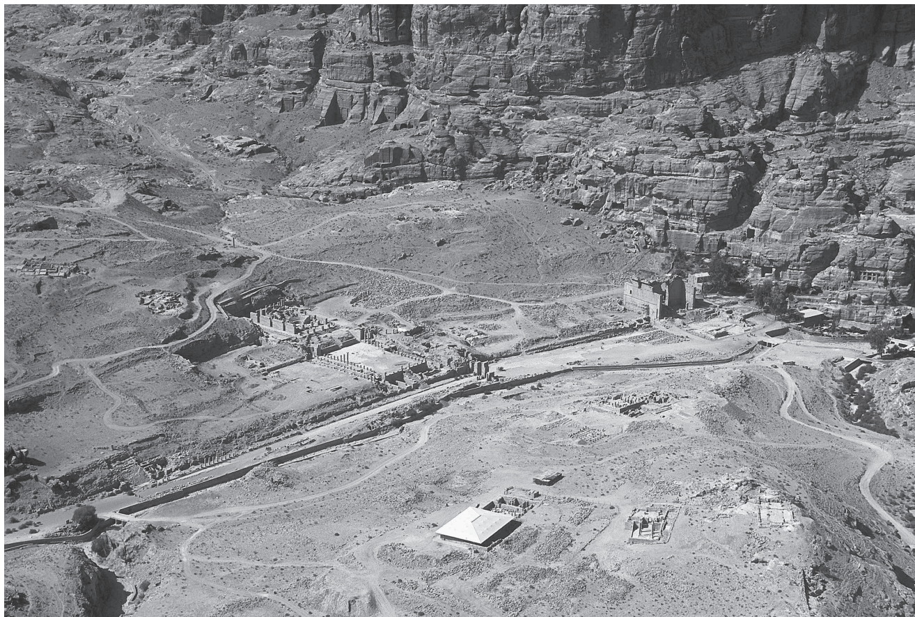
FIG. 1. The centre of Petra. The “Great Temple” is in the centre left, the Temple of the Winged Lions is opposite the temple, across the Colonnaded Street.